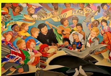
Image: https://images.flydenver.com/Art-at-DIA/Permanent-Works/Children-of-the-World-Dream-Peace/ Mural by Leo Tanguma.

“They will beat their swords into plowshares and spears into pruning hooks....Let us walk in the light of the Lord.” Isaiah 2:4-5